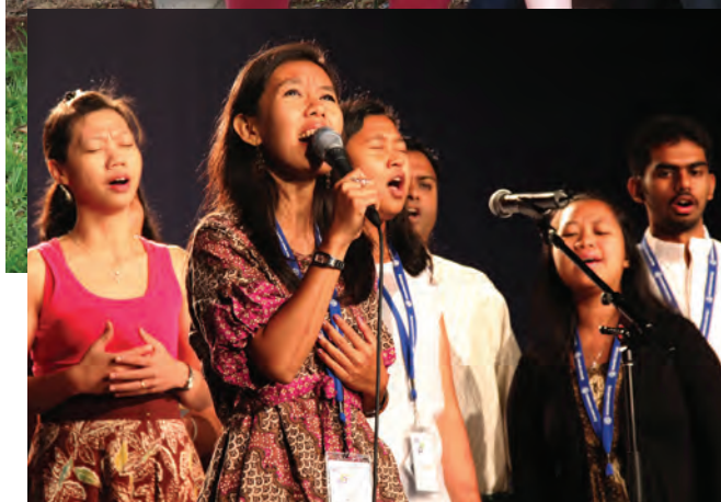
Worship at GYS 2015.